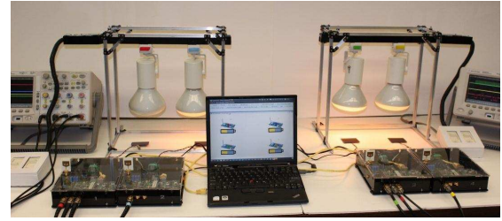
Figure 3. EnHANT demonstration setup.

The demonstration setup, shown in Fig. 3, consists of four prototypes communicating with each other wirelessly using UWB-IR transceivers. An oscilloscope connected to a prototype is used to show impulse-radio-based wireless communications . Using an oscilloscope, demo participants can observe the individual pulses generated by the prototypes, and can visualize the details of the employed modulation and en-